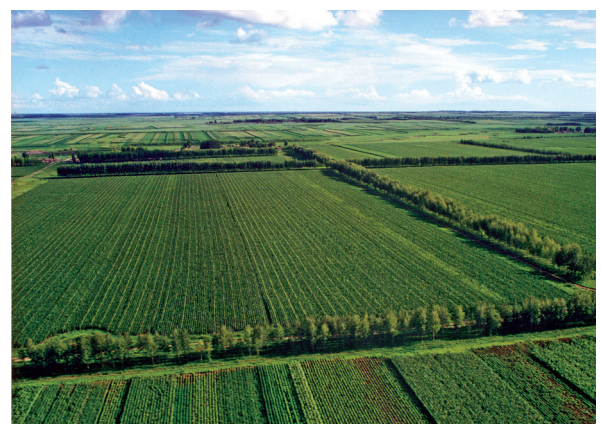
West Liaohe Irrigation District in Inner Mongolia Autonomous Region

(2) Vigorously develop water-saving irrigation by promoting high-efficiency water saving irrigation technologies including pipe water conveyance, spray irrigation and micro-irrigation; guide local and social capital to invest in water-saving irrigation; strengthen the construction of metering facilities; improve the methods used for collection of water tariff; better integrate water-saving solutions that are respectively