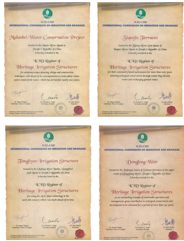
ICID Heritage Irrigation Structures in China

China is a member of the International Commission on Irrigation and Drainage (ICID). Its cooperation with ICID covers multiple dimensions and takes a variety