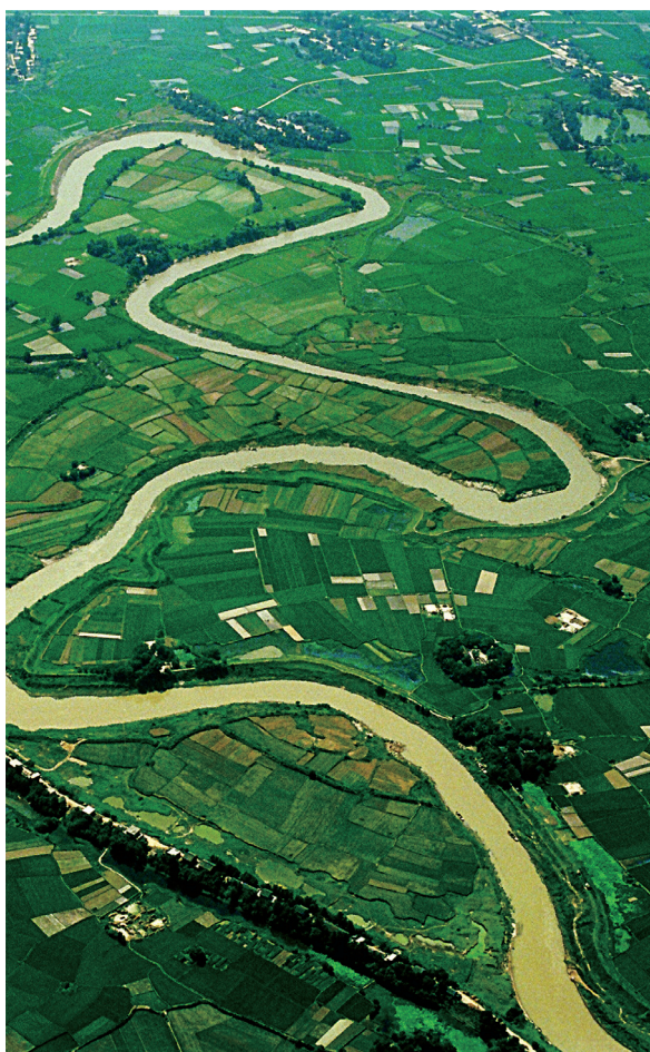
Pishihang Irrigation District, located in Anhui Province

First, a long-term mechanism for stable growth of investment in farmland water conservancy is yet to