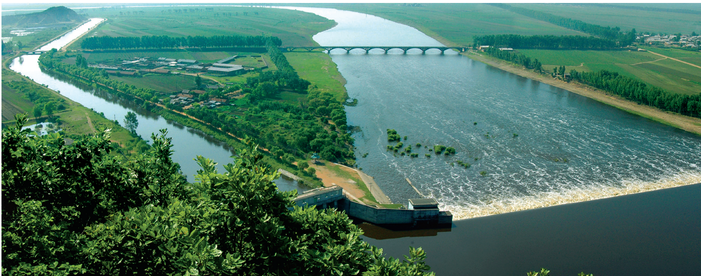
Headworks of Yintang Irrigation District in Heilongjiang Province

of forms such as international meetings, bilateral exchanges, and participation in running for ICID leadership.