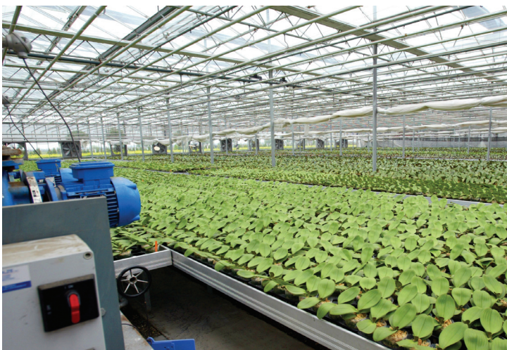
Experiment of micro and sprinkler irrigation technology

mountainous southwestern regions for better drought relief preparedness.