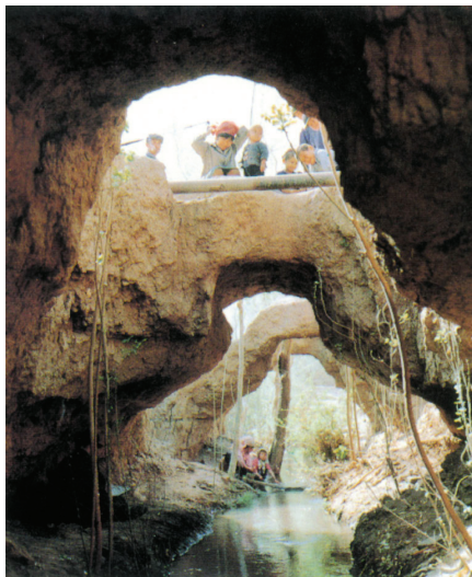
Karez Well in Xinjiang Uygur Autonomous Region

In parallel with extensive development of irrigation, China has also paid equal attention to control of surface and sub-surface water logging and salinization.