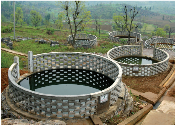
Small waterworks in Guizhou Province

the construction and management levels of small farmland water conservancy projects.