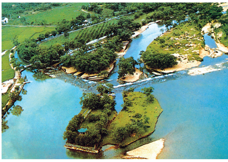
Remains of the inlet of Lingqu Canal

Meanwhile, main drainage river channels have been dredged and expanded; a great number of farmland drainage systems have been put in place; drainage sluices and pumping stations are built; alkaline land gets irrigated, and open ditch drainage applied. Flood water has been diverted for desilting purpose. Irrigation and drainage by way of well is applied; and vegetation is planted in line with specific soil conditions.