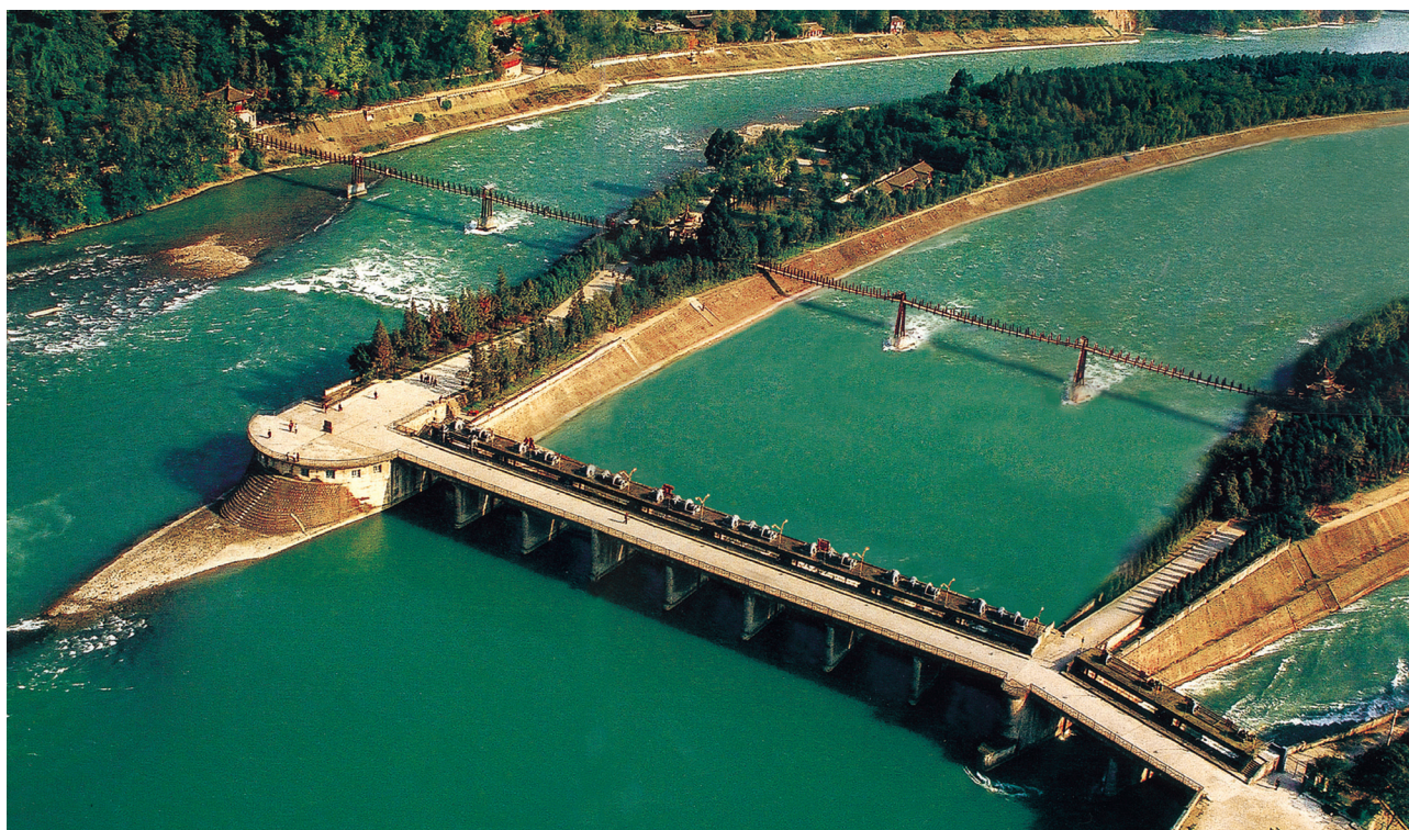
Headworks of Dujiang Weir

Since 1949, 97,735 reservoirs in various types have been built, with a combined capacity of 839.4 billion m 3 ; 4.56 million small dams and 6.89 million water cellars have been completed, which is supplemented by 4.83 million farmland electromechanical wells with installed capacity of 494.32 million kW; 434,000 fixed electromechanical pumping stations have been constructed, with installed capacity of 27.16 million kW; the installed capacity of flow irrigation and drainage, spray irrigation, and drip irrigation facilities reached 25.63 million kW; there are 7,772 irrigated districts with designed coverage \geq 667 ha each, totaling 33.534 million ha in irrigated area. The size of irrigated arable land has grown from 15.933 million ha in 1949 to 64.54 million ha at present. During the same period, irrigated forage land reached 0.85 million ha; and total grain output went up from 113.2 billion kg to 601.9 billion kg.