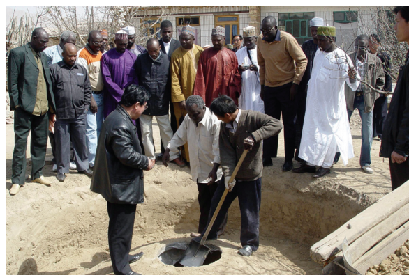
Nigerian engineers visited water tank in Dingxi City, Gansu Province

Since China's reform and opening up, we have engaged in both multilateral technical exchanges and cooperation with international organizations including UNFAO, UNICEF, EU, World Bank, Asia