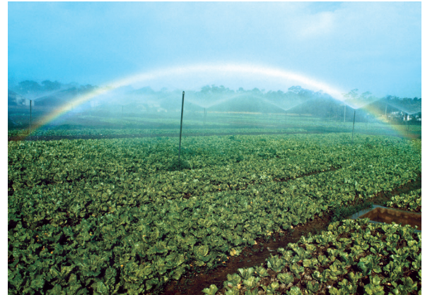
Sprinkler irrigation in Guangxi Zhuang Autonomous Region

(4) Vigorously drive forward the construction of water source projects and new irrigation areas: build a number of modernized irrigation areas with matching soil and water conditions at a faster pace; effectively