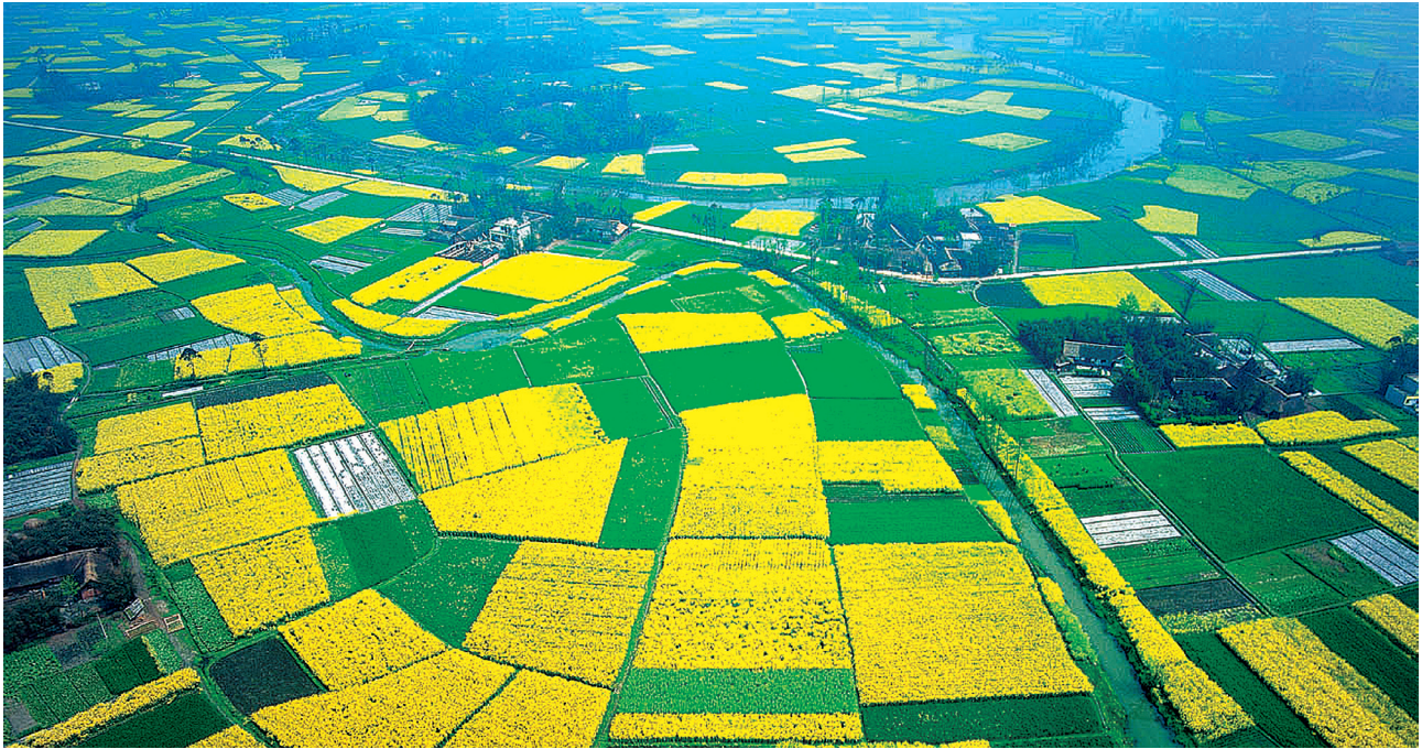
Dujiang Weir Irrigation District

management” of irrigation water consumption; and set up a sound incentive and constraint mechanism to facilitate water saving.