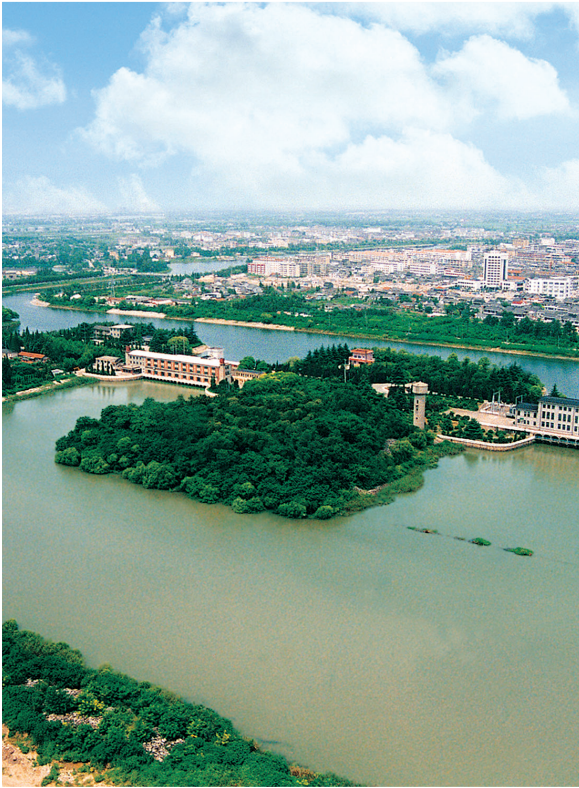
Jiangdu Pumping Station in Jiangsu Province

based on structural measures, agricultural processes and water management; accelerate the implementation of regional economy-of-scale high-efficiency water-saving irrigation; and make sure high-efficiency water-saving irrigation systems cover an additional 3.3 million ha of farmland during the 12th Five-Year Plan period, so that such irrigated area will total 6.6 million ha.